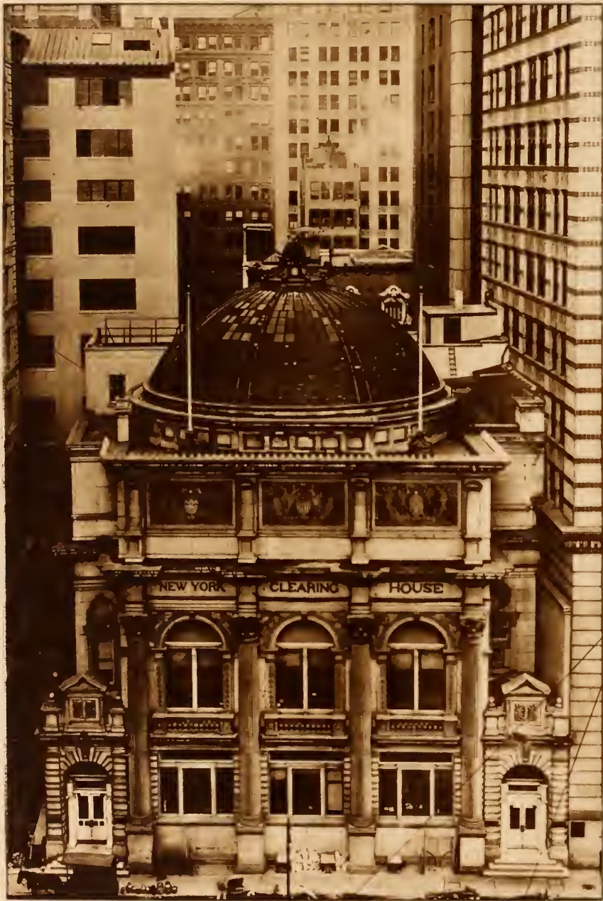
NEW YORK CLEARING HOUSE. More than 60 banks and trust companies associated to exchange checks and bills against each other. Balance paid every day before 1.30 P. M.